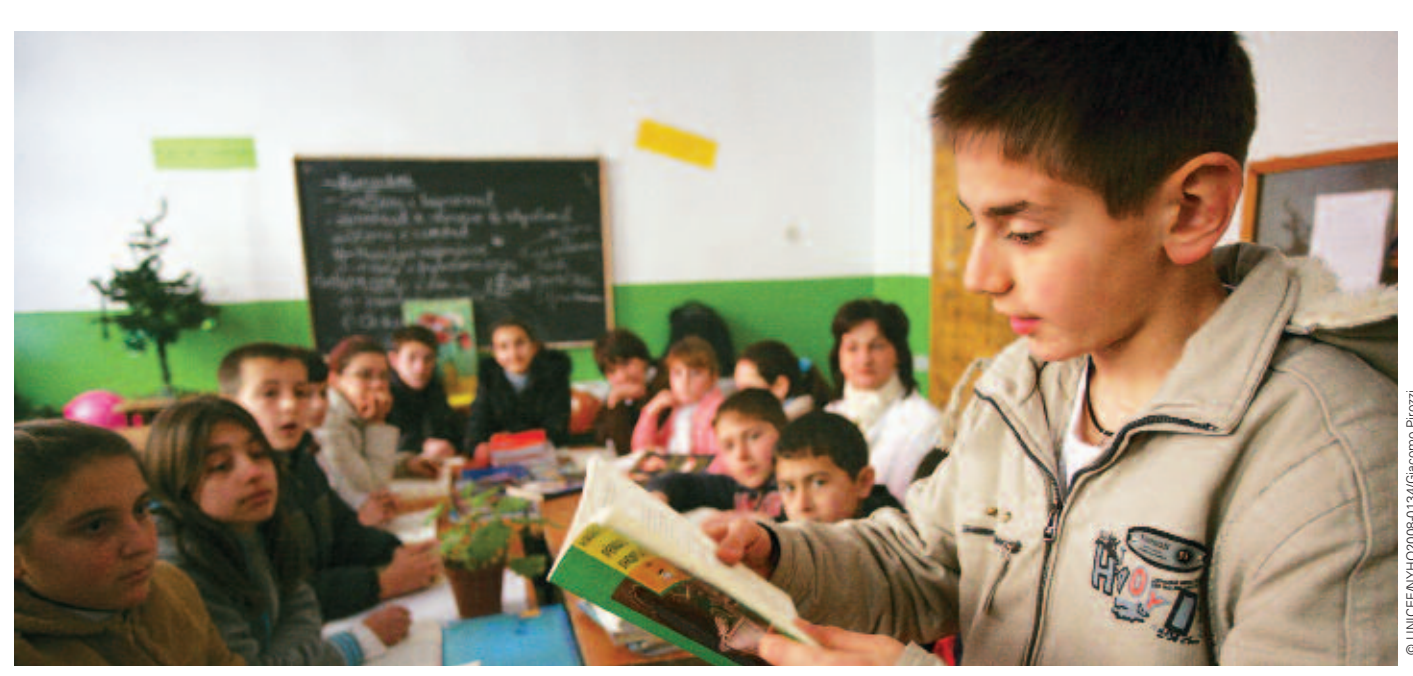
Providing quality education is central to enabling children to reach their full potential. A 13-year-old boy reads aloud as his teacher and classmates listen, in Ahmet Gashi Compulsory School in Tirana, Albania.

tant decisions applying the treaty's provisions. Furthermore, since 1989, one third of the countries studied had also integrated the Convention into their national constitutions. Almost all of these countries had made strong efforts to bring their legislation into conformity with the Convention by adopting child rights codes or through the gradual, systematic reform of existing law, or both.