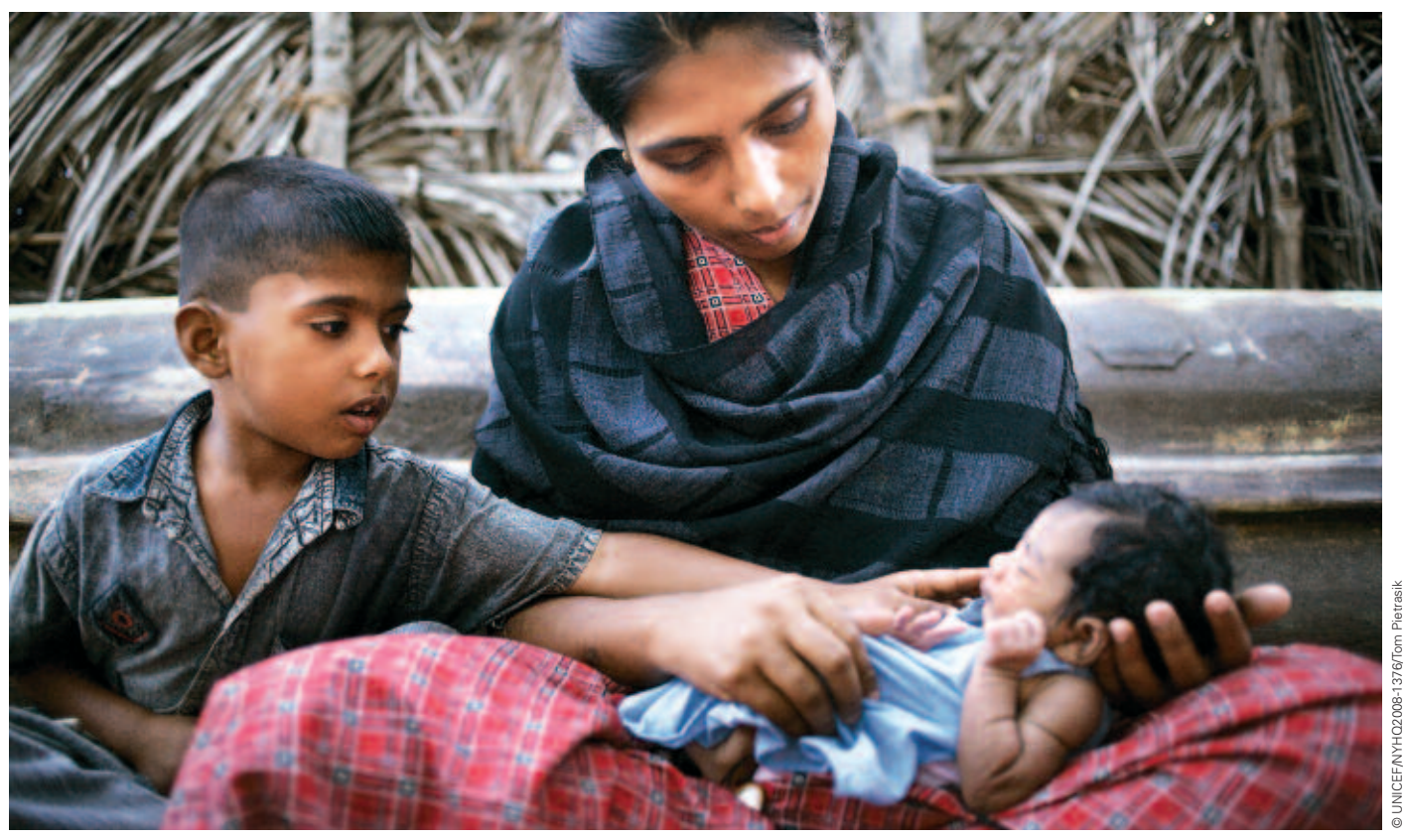
Supporting social and cultural values that promote the rights of children is central to protecting them from violence, abuse, exploitation, discrimination and neglect. A boy plays with his baby sister in Aragam Bay Village in the eastern Ampara District, Sri Lanka.