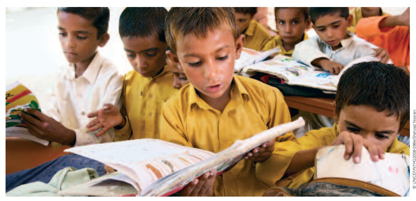
Developing the capacities of governments, communities, families and children is critical to the greater understanding and promotion of children's rights. Boys study using their exercise books at Basti Arian Government Boys Primary School in the village of Basti Arian in Rahim Yar Khan District, Punjab Province, Pakistan.