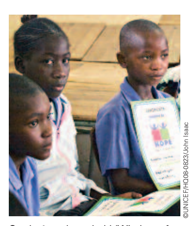
Grade 4 students hold 'Window of Hope' certificates at the end of a life-skills education session at Ehenya Primary School in the northern Oshana Region, Namibia.

The work to fulfil child rights is not an easy task. But it is one that cannot be ignored. The Convention on the Rights of the Child demands that families, communities and governments acknowledge and meet their fundamental responsibilities to care for and protect the world's 2.2 billion children. While I believe the international community has come a long way in the implementation of the Convention, stronger child, youth and community participation is required to sustain success. Ultimately, children will determine the moral and ethical future of nations, and the world. Their voices must be heard.