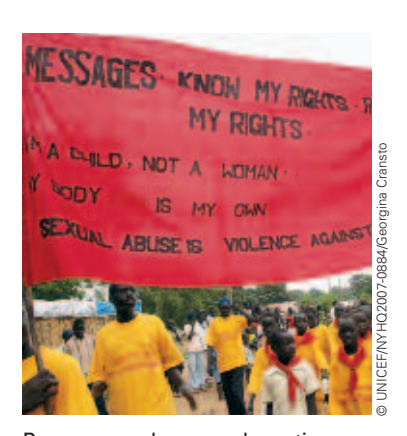
Boys carry a banner advocating children's rights and opposing sexual abuse during a march celebrating the Day of the African Child in Juba, capital of Southern Sudan.

This fall, the Committee on the Rights of the Child will spend focused energy analysing the challenges, old and new, that confront the realization of children's rights. After 193 ratifications and 19 years of reporting, the need for a robust evaluation and analysis mechanism to better understand the situation of children is more important than ever. We must continue to work to ensure the dignity of children is preserved and hold States accountable for defining their obligations, both in material and moral terms, to prevent violations of children's rights. This includes challenging societies to address the many and varied ways they commodify children and the associated discrimination that does not view children as legitimate rights holders. States parties must include children in the policymaking process and ensure their voices are heard and considered in the development of programmes and standards that uniquely impact their lives. Only when States embrace children as their partners will their rights take root and later bear the fruit of peace and equality the Convention seeks for each child. Members of the Committee join the community of nations and individuals worldwide that in celebrating children's rights and the 20th anniversary of the Convention.