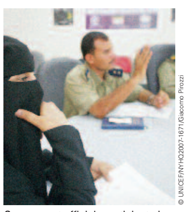
Government officials participate in a training session on the prevention of child trafficking at the Tihama Development Authority in the town of Hodeidah, Yemen.

On the 20th anniversary of the Convention on the Rights of the Child, I launch an urgent appeal to all governments facing child trafficking to undertake bold and coordinated actions at national and international levels to put an end to the exploitation of the world's children. The continued practice of child trafficking is compromising the promotion of child rights and is undermining the achievements made since the Convention was ratified. It is my hope that through the combined efforts of governments, international organizations and individual citizens, genuine and effective promotion of child rights will be realized and child trafficking will be ended.