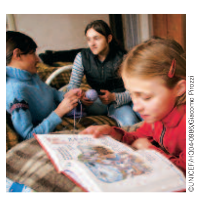
12- and 15-year-old girls talk and read in their bedroom at the 'Sparrows' shelter for children living and working on the streets in Tbilisi, Georgia.

Even the smallest effort can bring about the greatest victory – saving the life of one of these beautiful children. They want nothing more than to actually be children, with all of the fun, freedom and security that childhood should entail – and that countries acknowledge in the Convention on the Rights of the Child.