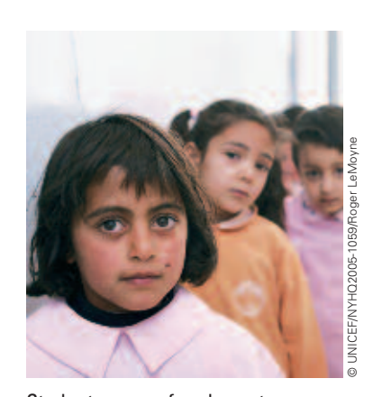
Students queue for class at Timnin El-Tahta, a public school in the north-east Beqaa Valley region, Lebanon.

As the Convention on the Rights of the Child celebrates its 20th anniversary, the private sector has every reason to be grateful for the emphasis it brings to the power of developing a new generation of citizens, and the reminder that children are the flowers of our societies. We take great joy in having been provoked by the Convention's ideas, and in looking forward to what we can do to promote them in the future.