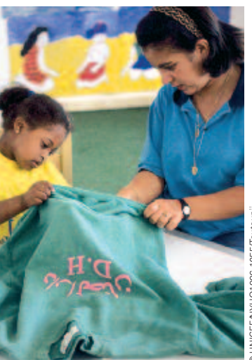
A yound girl and therapist at Dar el Hanan (House of Mercy) centre for disabled children in Alexandria, Egypt.

In the end, the child rights movement of the heart may become the most powerful legacy of the Convention. Through its decades of drafting and eventual adoption, the Convention marked a first in history – a moment when the community of nations acknowledged the dignity and intrinsic worth of all children. It will be fulfilled with another first - the moment when communities of citizens celebrate the value of every child with no exceptions or limits. When this happens, the age-old saying will be fulfilled: The stone the builders rejected has become the cornerstone, and it is marvelous to behold.