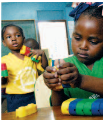
A girl plays with colourful plastic blocks at Denham Town Basic School in the parish of Kingston and St. Andrew, Jamaica.

None of these measures would have been possible without the combination of two fundamental factors: the will of the President to give child protection policies the priority they deserve, and a serious macroeconomic policy that assures the resources needed for its implementation – regardless of the external shocks that are affecting the economy. An important benefit of the fiscal surplus rule applied in Chile is that expenditure is not linked to the transitory components of income, which, in the context of the current crisis, allows for the use of the resources saved by our country during the boom years. This has enabled us to ensure the continuity of the social protection system that is the seal of the Government of President Bachelet and that is at the heart of the Convention on the Rights of the Child.