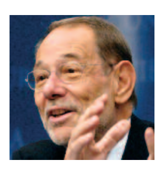
JAVIER SOLANA High Representative for the Common Foreign and Security Policy, SecretaryGeneral of the Council of the European Union