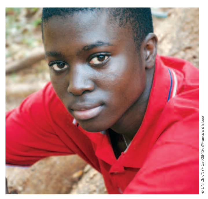
To make the vision of the Convention a reality for every child, it must become a guiding document for every human being. An 18-year-old boy advocates against the sexual exploitation and abuse of children, and participates in several child rights groups in his community in Lusaka, Zambia.

In this sense the need for a change in values links back to the history of the Convention and the campaigns for child rights that preceded it. Those campaigners who were outraged by the treatment of children in 19th-century factories or by their